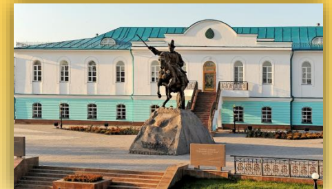
Ablai Khan’s Residence