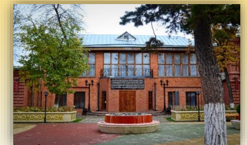
North-Kazakhstan Regional Museum