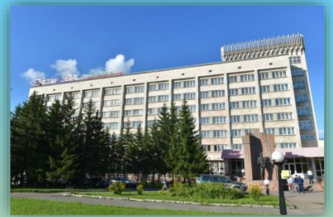
Hotel “Kyzyl Zhar”